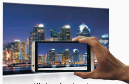
High refresh rate

High brightness: 5500nits ; High gray scale: 65536 levels ; High refresh rate: 2000Hz; High contrast ratio:5000:1 .